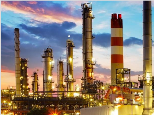
Typical Refinery – Stock Image

Refinery requires extra clean bottles for testing purposes in laboratory.